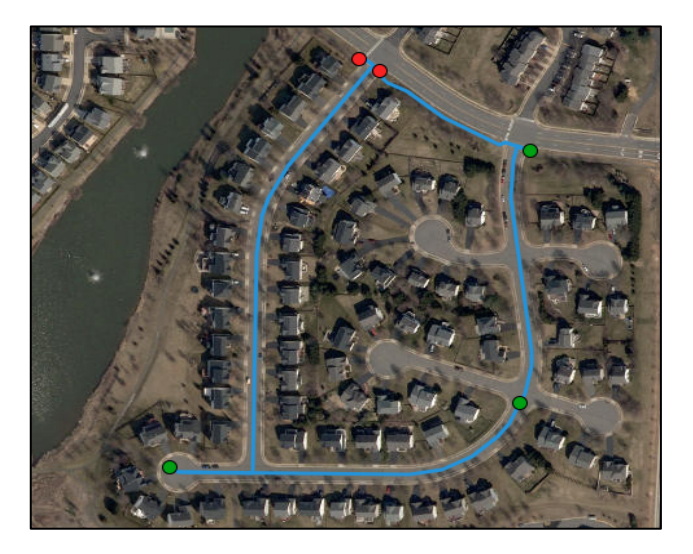
Section C Approximately 0.5 mi Baish Dr SE + Ebaugh Dr SE + Rusert Dr SE