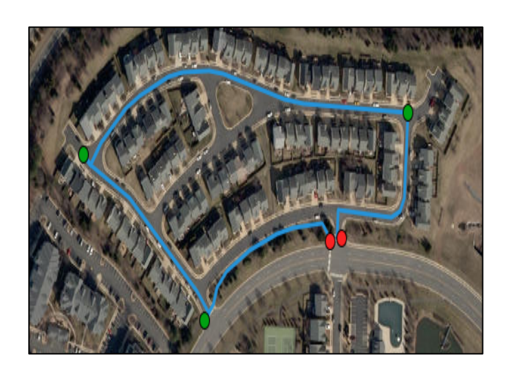
Section D Approximately 0.5mi Whipp Dr SE + Hope Pkwy